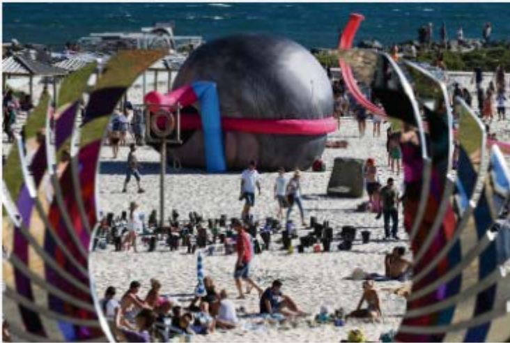
Sculpture by the Sea.