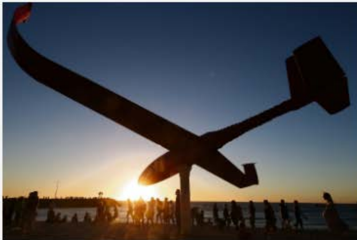
Final Approach by Geoff Overheu in collaboration with the Beverley Soaring Society (WA).