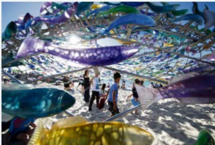
Swirling Surround by B.Jane Cowie.