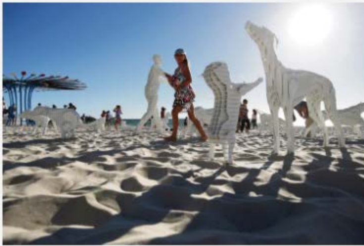
Spirit by April Pine.