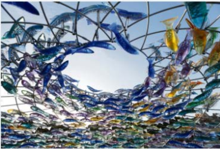
Swirling Surround by B.Jane Cowie.