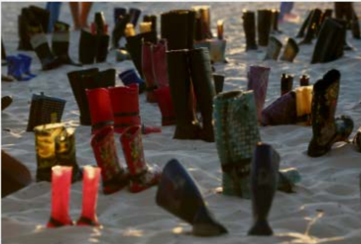
Sculpture by the Sea.