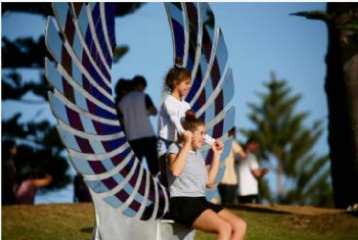
Waiting in the Wings by Denise Pepper.