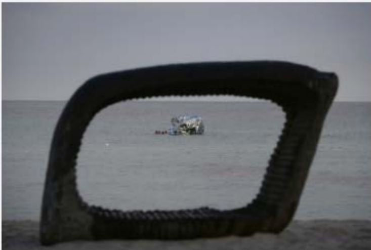
Zhan Wang's Floating Rock.