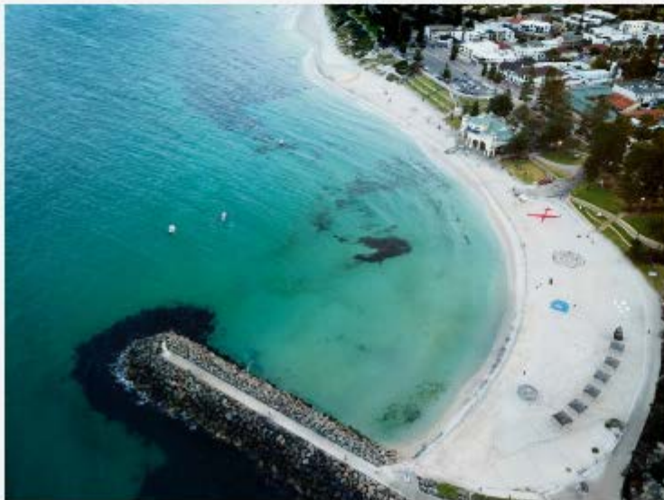
Sculpture by the Sea from the air.